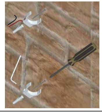
Fix the brackets with screw suitable to the support