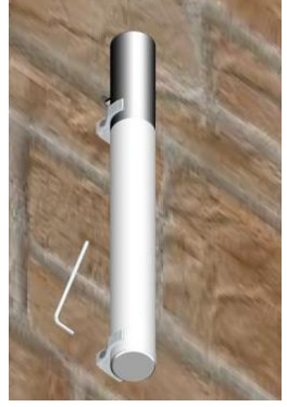
Insert "ZWord" light body by locking in the two brackets with suitable screws provided.