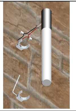
Carry out the electrical connection respecting the polarity