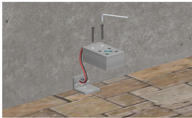
Carry out the electrical connection and fix the Light body paying attention to the polarity of the cables and secure the body with the screws provided.