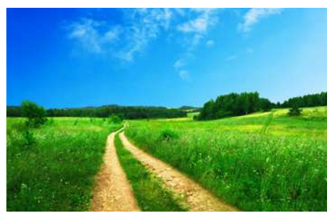
Countryside: 2.000 ions/cm<sup>3</sup>

But it is included between 100 and 200 ions/ cm<sup>3</sup> in homes and in closed environments in general.