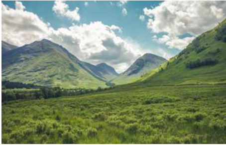
Mountain: 15.000 ions/cm 3

As an example, we indicate the average concentration of air ions in some natural areas: