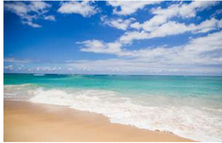
Coast areas: 50.000 ions/cm 3