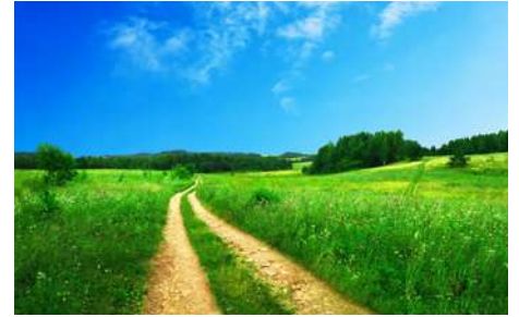
Countryside: 2.000 ions/cm 3

But it is less than 100 ions/ cm 3 in homes and in closed environments in general.